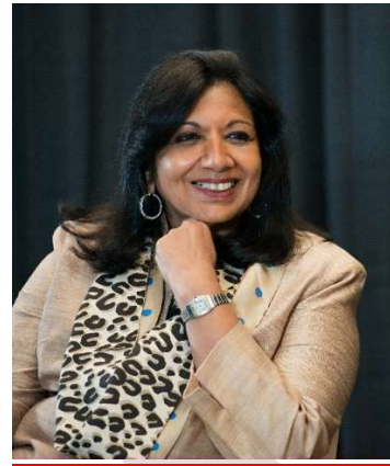
Kiran Mazumdar Shaw